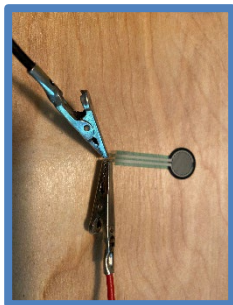
Clipping to FSR