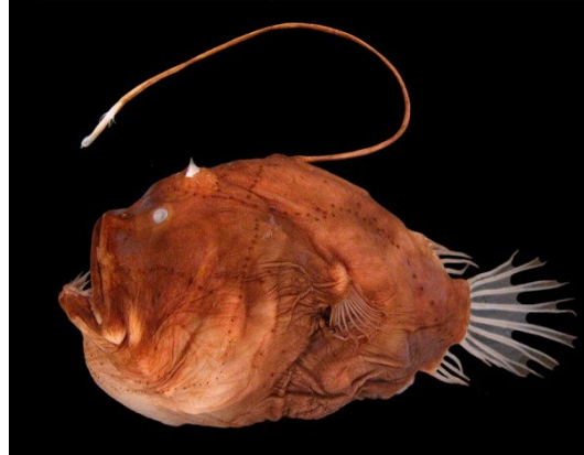
Deep-Sea Anglerfish Expressing Bioluminescence